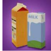
Printed carton board