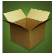
Unprinted carton board